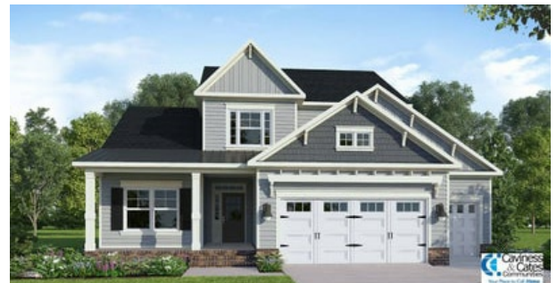
Elevation WB Golf Cart Garage

Prices, plans, dimensions, features, specifications, materials, and availability of homes or communities are subject to change without notice or obligation. Illustrations are artists depictions only and may differ from completed improvements. All prices subject to change without notice. Please contact your sales associate before writing an offer.