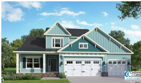
Elevation WB 3 Car Garage