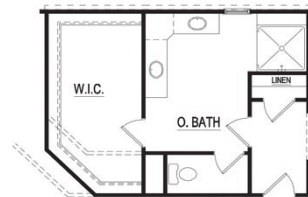
OPT. OWNER'S BATH

Prices, plans, dimensions, features, specifications, materials, and availability of homes or communities are subject to change without notice or obligation. Illustrations are artists depictions only and may differ from completed improvements. All prices subject to change without notice. Please contact your sales associate before writing an offer.