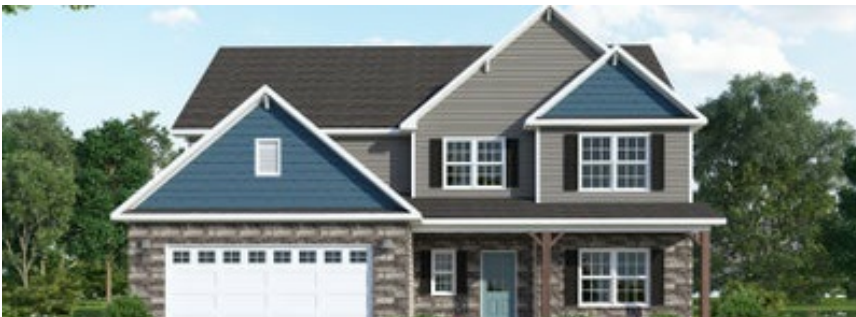
ARCHIVED 07/07/2022 - Elevation B