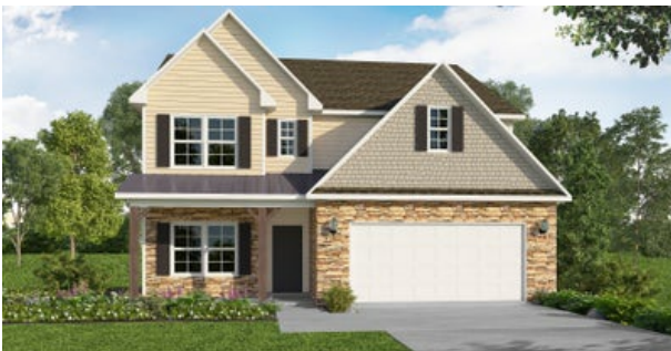
ARCHIVED 07/07/2022 - Elevation B