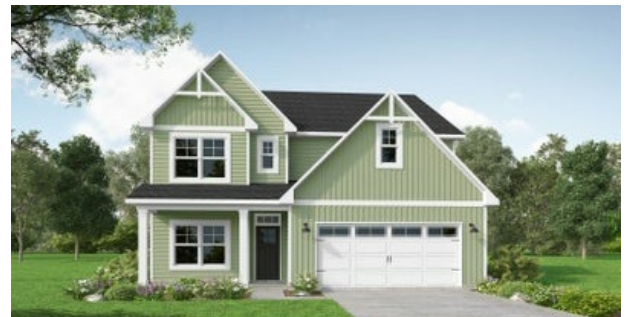
ARCHIVED 07/07/2022 - Elevation F