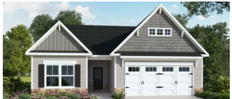
Elevation TW- ARCHIVED 2/8/2023