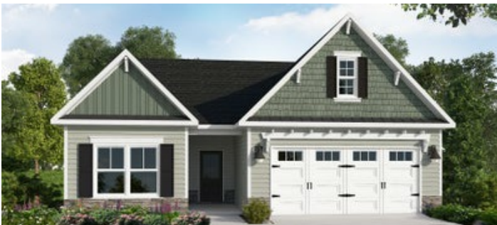
Elevation C - ARCHIVED 2/8/2023