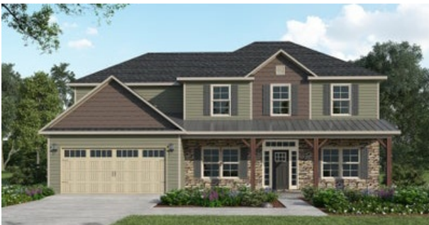
ARCHIVED 07/07/2022 - Elevation B