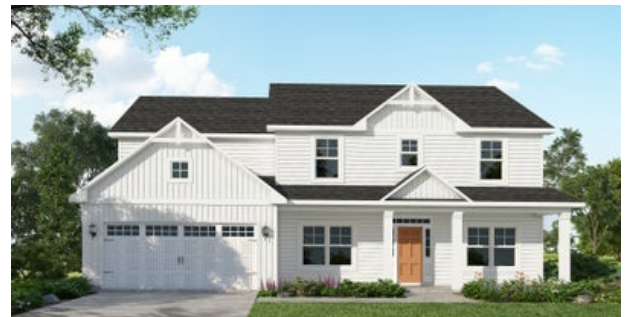
ARCHIVED 07/07/2022 - Elevation F