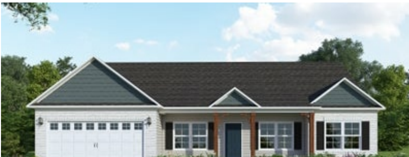
ARCHIVED 7/5/2022 - Elevation B