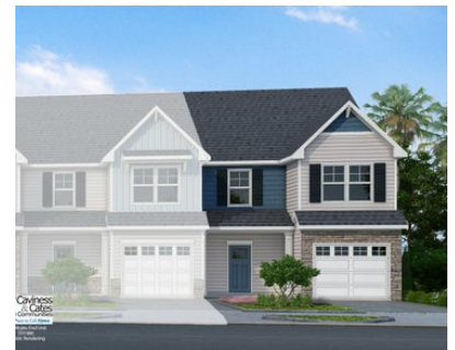
End Unit with Shake

Prices, plans, dimensions, features, specifications, materials, and availability of homes or communities are subject to change without notice or obligation. Illustrations are artists depictions only and may differ from completed improvements. All prices subject to change without notice. Please contact your sales associate before writing an offer.