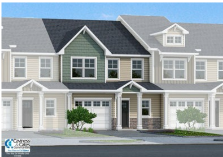
Middle Unit with Shake