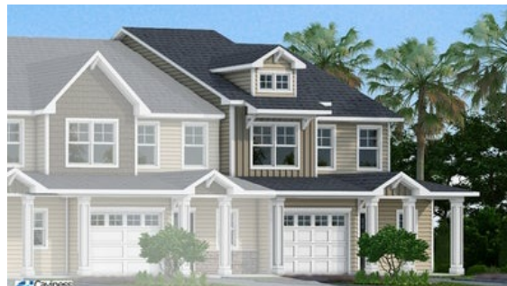
End Unit with Board & Batten