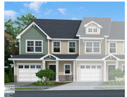
End Unit with Shake