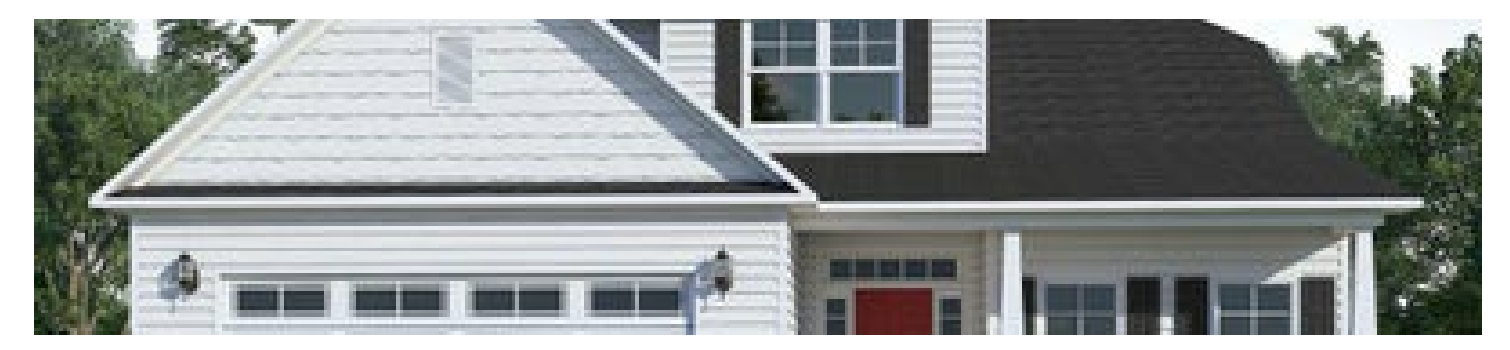
Elevation C with Dutch Hips