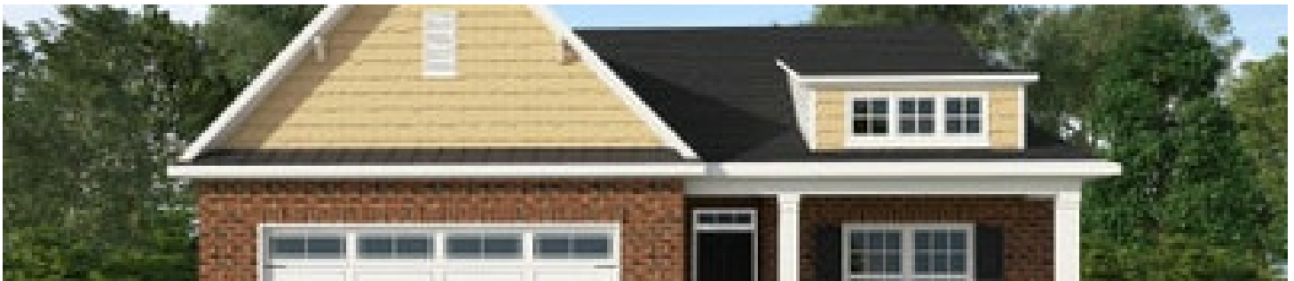
Full Brick Elevation