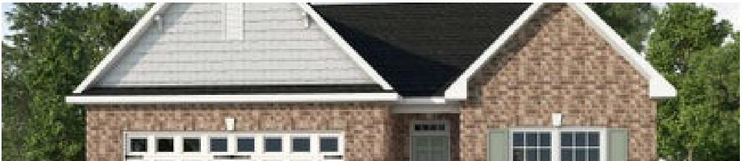
Full Brick Elevation