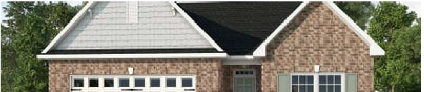
Full Brick Elevation