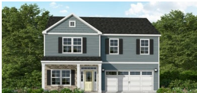
Elevation B with Brick