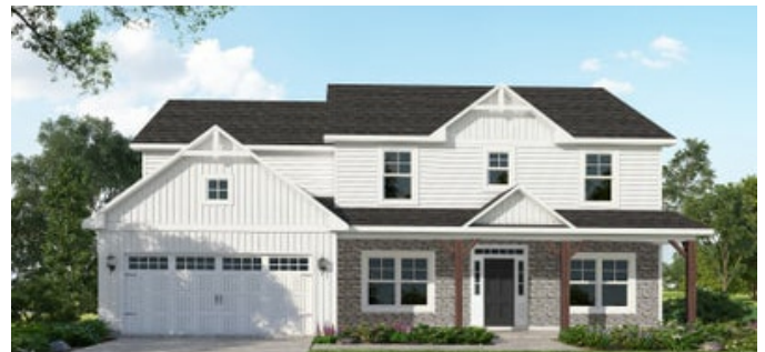
Elevation F with Stone