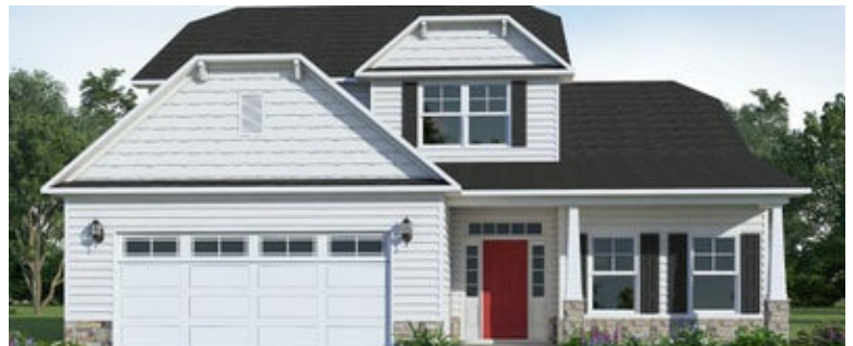
Elevation C with Dutch Hips

Prices, plans, dimensions, features, specifications, materials, and availability of homes or communities are subject to change without notice or obligation. Illustrations are artists depictions only and may differ from completed improvements. All prices subject to change without notice. Please contact your sales associate before writing an offer.