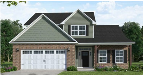
ARCHIVED 7/06/2022 - Elevation B