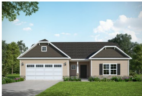
Elevation C - NO DORMER