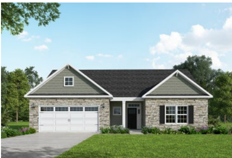
Elevation B - NO DORMER