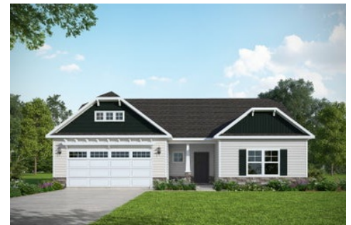
Elevation D - NO DORMER