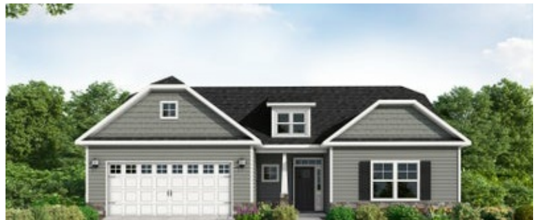
Elevation C with Dutch Hips