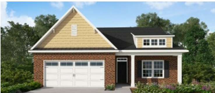
Full Brick Elevation