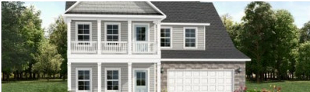
Elevation B - Legacy Lakes (Picture Frame Windows in Lieu of Shutters)