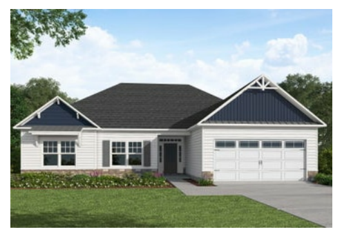
Elevation B Elevation C Elevation E

Prices, plans, dimensions, features, specifications, materials, and availability of homes or communities are subject to change without notice or obligation. Illustrations are artists depictions only and may differ from completed improvements. All prices subject to change without notice. Please contact your sales associate before writing an offer.