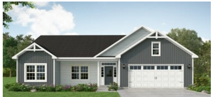
Elevation F with Brick